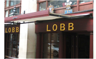
LOBB THE BOOTMAKER