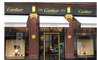
NEW BOND STREET