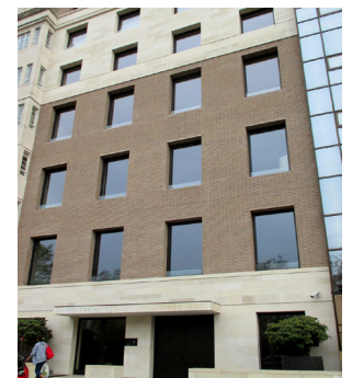
5 PRINCES GATE

The penthouse flat at no. 5 was, at £50m (plus £3.5m Stamp Duty), the most expensive UK home purchased in 2014. In January 2015 no. 13/14 Princes Gate sold for £70m. As neither is architecturally special, it's an option to cycle to see these and return. Much of the value is in their location and the views residents enjoy across Hyde Park.