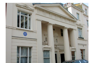
IAN FLEMING'S HOUSE

Born into a privileged banking family, James Bond's creator bought this bachelor pad from the fascist leader Oswald Mosley in 1934 and lived in it until 1945, latterly working for Naval Intelligence. He subsequently lived nearby at 16 Victoria Square from 1953 until his death in 1964.