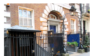
ANNABEL'S AND CLERMONT