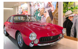
JD CLASSIC CARS