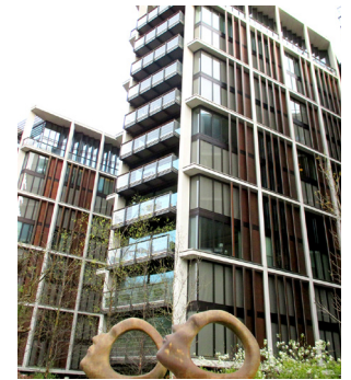
ONE HYDE PARK

The 86 glitzy flats across three blocks, opened in 2009, epitomise super-prime development for the richest. Developers Nick and Christian Candy made a fortune in the real estate boom in London that followed the post-Soviet privatization of state assets such as gas, oil and coal fields. The Candy brothers' partners included former Qatar Prime Minister Sheikh Hamad bin Jassim al-Thani who paid £40m for an apartment here. In 2013 only 17 of the apartments were registered as primary residences; few are lit at night. Mainly owned by secretive companies in offshore tax-havens, the flats have 24-hour SAS-trained security, an in-house maid service, and room service from the Mandarin hotel. A one bedroom flat was on the market for £9.9m in January 2015.