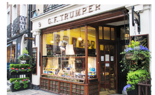
GEO F TRUMPER