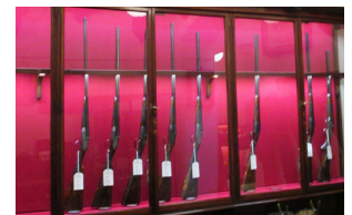
JAMES PURDEY AND SONS