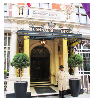
THE CONNAUGHT HOTEL