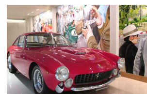
JD CLASSIC CARS