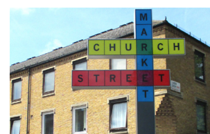
CHURCH STREET MARKET