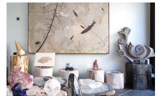
DALE ROGERS AMMONITE

Pimlico Road is where interior designers go to pick up the perfect discussion piece for their clients. Shops along the road sell c20th design, period antiques and contemporary art. The most unusual stock is at this shop, selling antiques that are not only exquisite but also the most ancient - palm frond fossils that are 55 million years old and meteorites that are billions of years old.