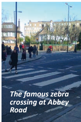
The famous zebra crossing at Abbey Road