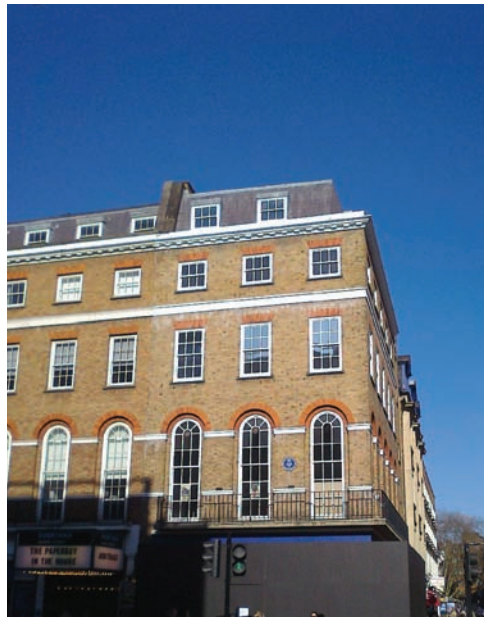
Site of the Apple Boutique