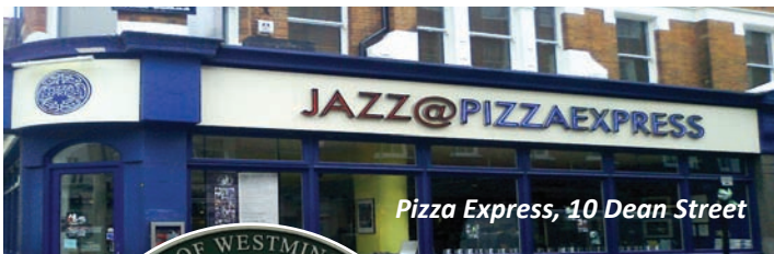
Pizza Express, 10 Dean Street

Still a studio today, The Beatles recorded Hey Jude (1968) and several tracks for the White Album here. Other albums recorded here include Bowie's The Rise and Fall of Ziggy Stardust and the Spiders from Mars, and Queen's first album Queen, which was released on the Trident label in 1973, as were their three subsequent albums. 🎵 Seven Seas of Rhye – Queen (1973)