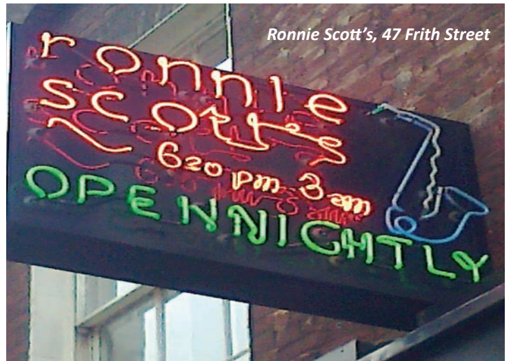
Ronnie Scott's, 47 Frith Street