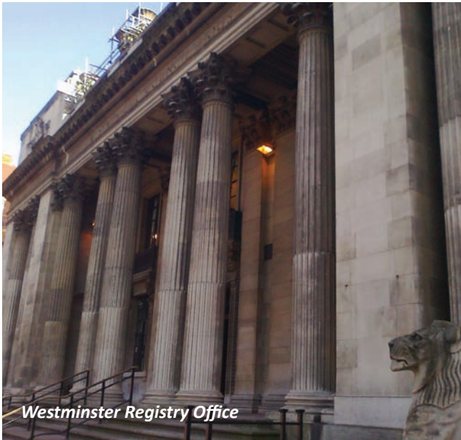
Westminister Registry Office